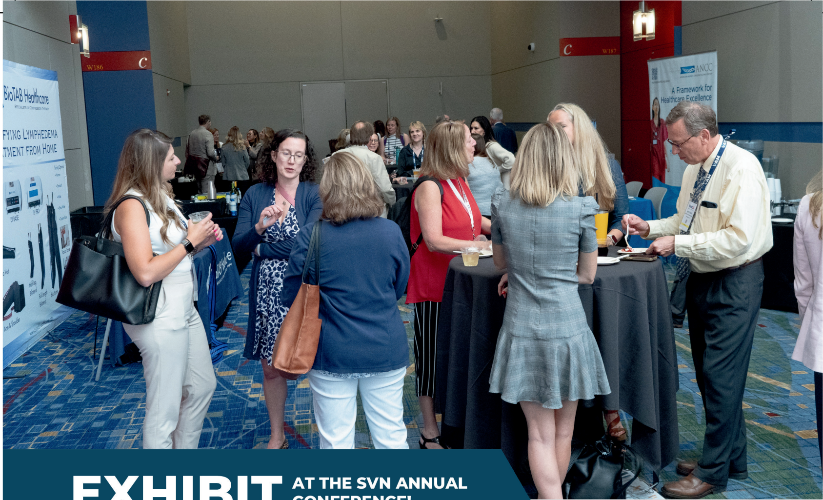
EXHIBIT AT THE SVN ANNUAL CONFERENCE!