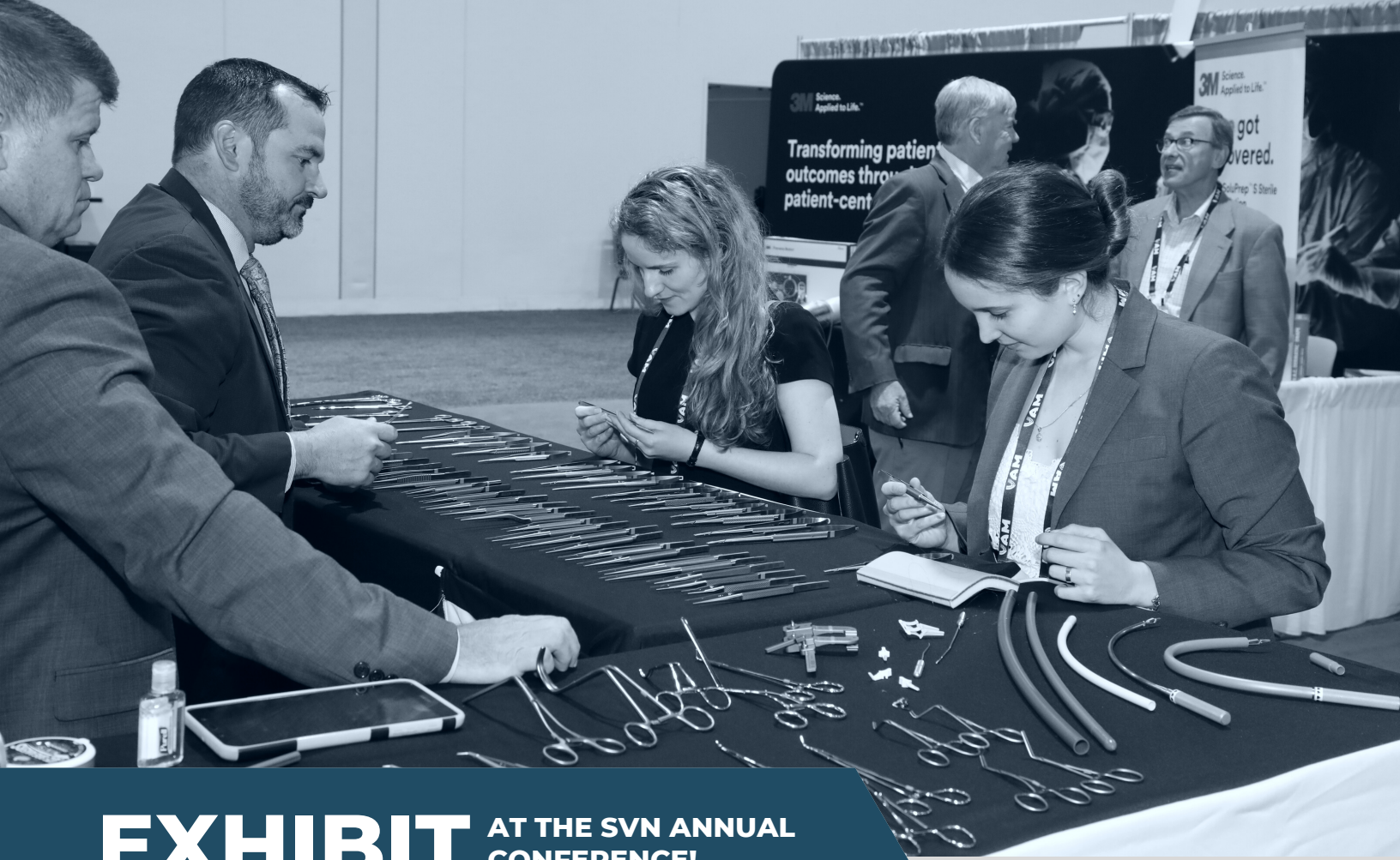
EXHIBIT AT THE SVN ANNUAL CONFERENCE!